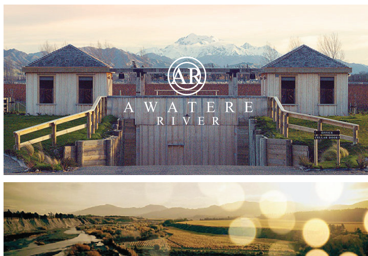
The glaciers of Mount Tapuae-o-uenuku's feed the Awatere River.